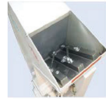
Hand throw hopper