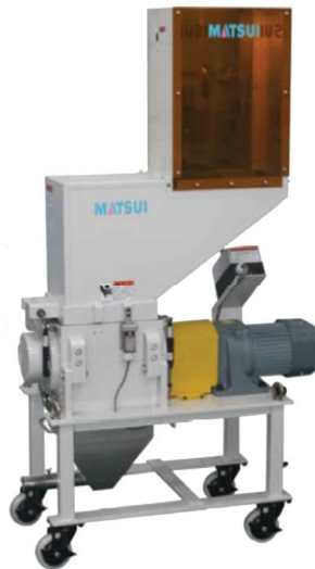
SMGL2 Low Speed