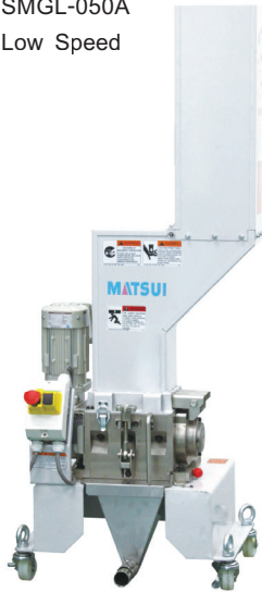
SMGL-050A Low Speed

Oblique Screen Stand \varnothing 8 mm., ( \varnothing 6 mm., \varnothing 10mm.)