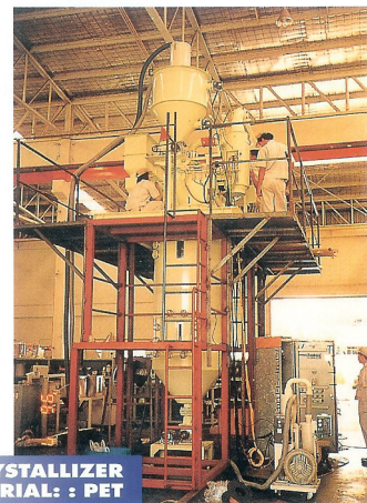
CRYSTALLIZER FOR MATERIAL : PET